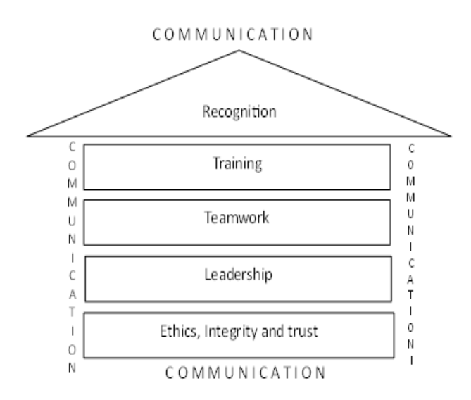
Figure 2. Total Quality Management's supporting elements foster communication.

TQM adoption is more than simply a management programme to complement or sweeten activities; it is necessary to boost work productivity. TQM must be goal-oriented to increase organizational performance (Thomas Packard, 1995). The eight parts that must be applied in organizational activities are elements that work together to form a TQM structure. Consider the following figure 2: